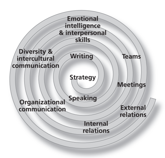
EXHIBIT 1.2 The Leadership Communication Framework

Communication strategy is included in the section on core skills (Section 1), but leaders will find they usually need to take a strategic approach to be a master of leadership communication. Therefore, developing a communication strategy will be emphasized throughout all sections of the text as we move from inside to the outer rings of the spiral. Strategy is the foundation on which any effective communication